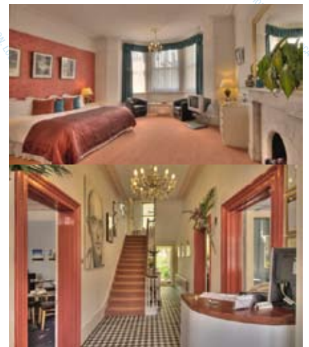
Visitors of TheClaremont.eu can view images from the hotel as well as make reservations.