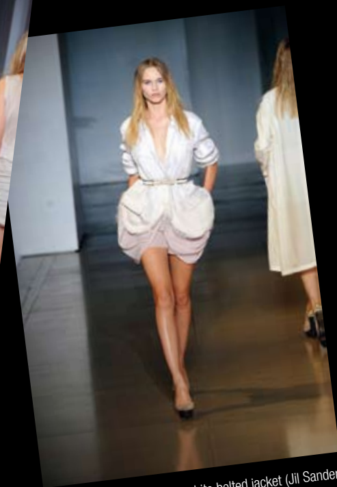
Beige short shorts under a white belted jacket (Jil Sander)