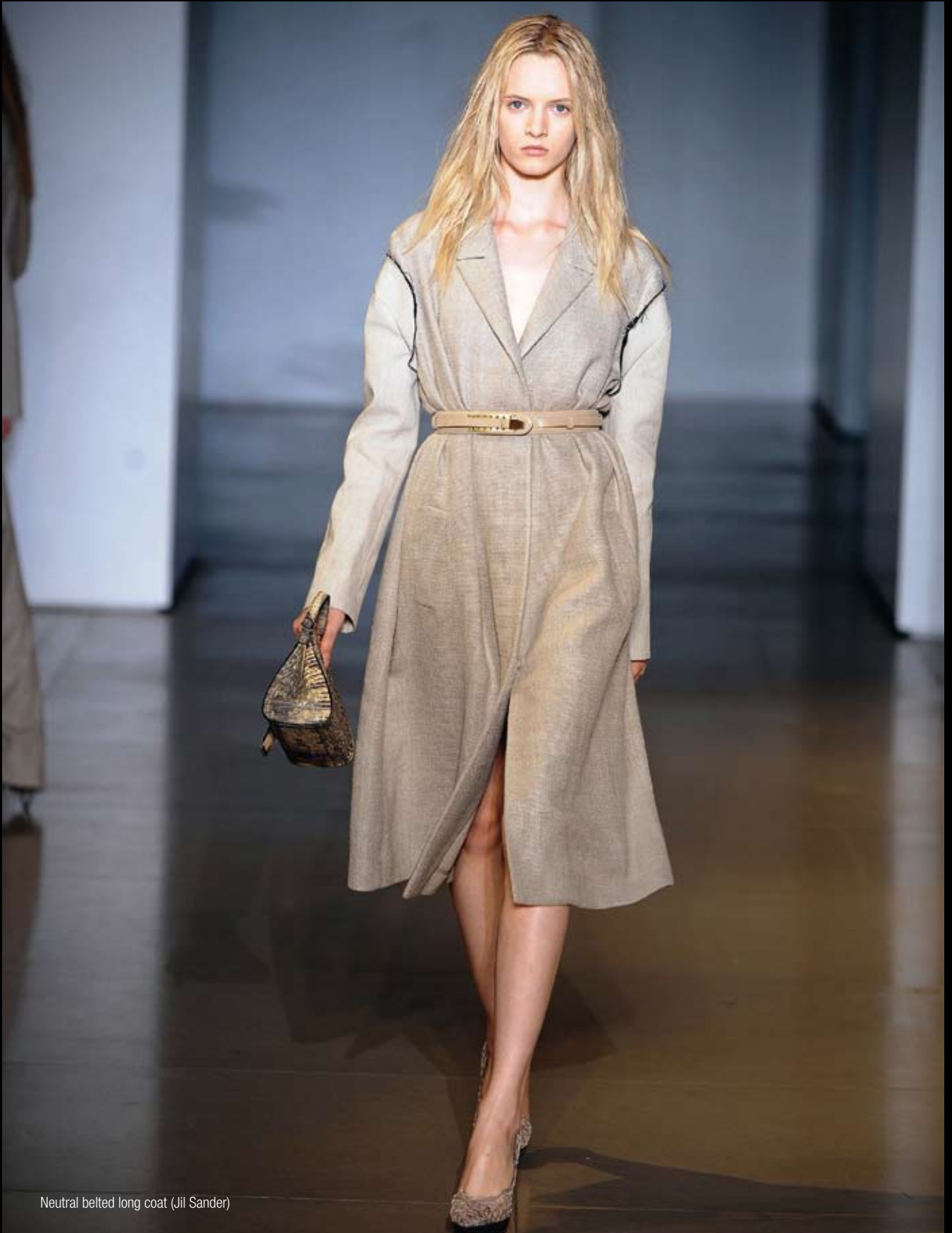
Neutral belted long coat (Jil Sander)