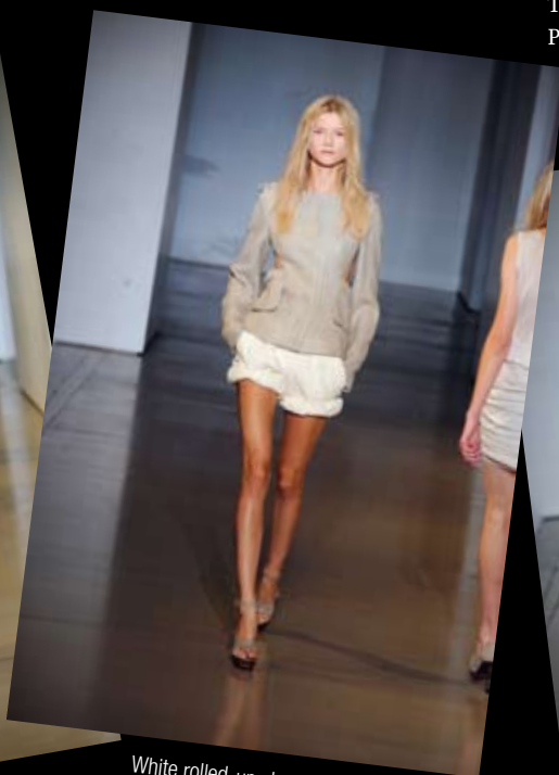
White rolled-up shorts under a nude-hued top of military inspiration (Jil Sander)