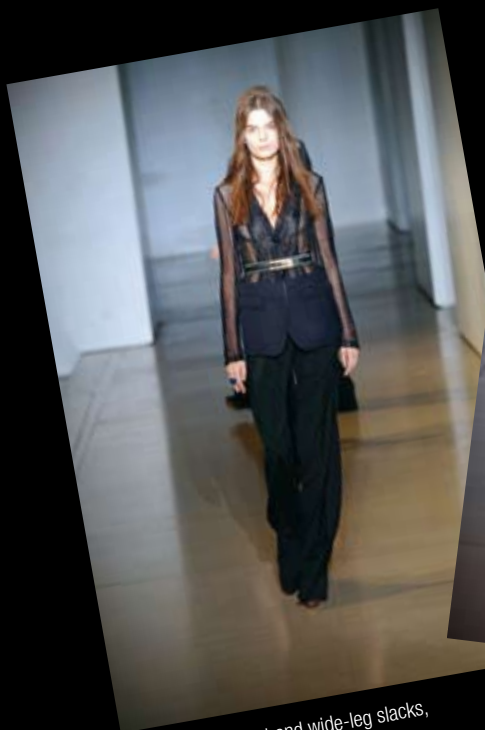
Sheer belted jacket and wide-leg slacks, for a glamorous night out (Jil Sander)