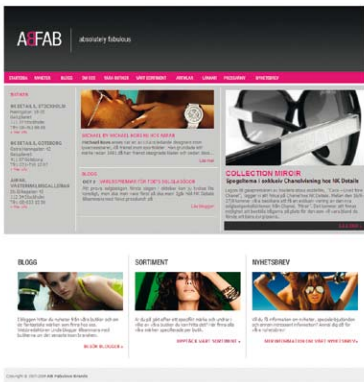
Absolutely Fabulous uses AbFab.eu to promote the products sold only at the company's three stores.

Use the answers to make a list of the online services your company needs. Then decide which services are most important. When the list is ready, it is time to take the next step.