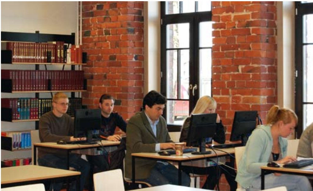
The administration of the International University Audentes in Estonia wanted to emphasise its status as a European institution and chose a .eu address.