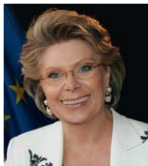
Viviane Reding, Commissioner for Information Society and Media, says that .eu should become the natural choice for everyone in Europe.

Registrations for .eu domains have been growing continuously following the boom in its first year. The biggest growth has been noted in some northern and eastern parts of the EU. On another happy note, worth celebrating, approximately 80 percent of domain names have been renewed for their second year, showing that confidence in .eu is high. ■